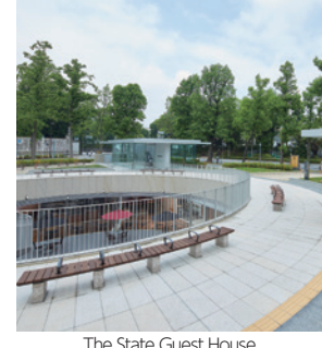
The State Guest House, Akasaka Palace Touritst Lounge

Located near Yotsuya station, this triangular park is flanked by tree-lined paths. Designed to be symmetrical, green lawns were laid out surrounding chalk-white pillars and fountains. Following the tree-lined path leads you to a fantastic view of the State Guest House. Currently, there is the State Guest House, Akasaka palace Tourist Lounge with cafes, shops, barrier-free restrooms, etc. in the park.